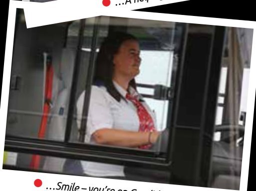
● ...Smile - you're on Candid Camera!...