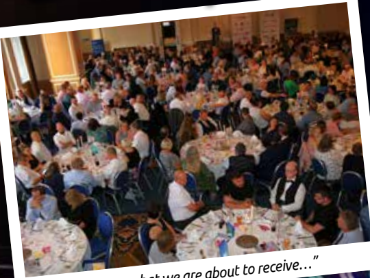
● "For what we are about to receive..."