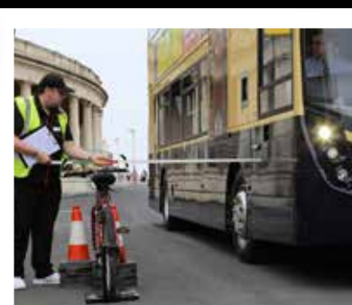
● Oh dear, too near!