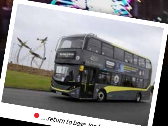
● ...return to base, leader!...