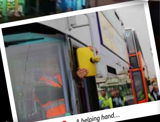
● ...A helping hand...