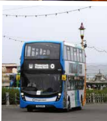
● ...Up hilly...ah!...