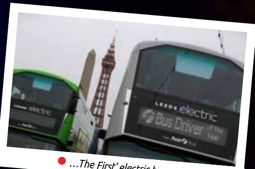
● ...The First' electric buses...