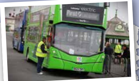
● The newly-delivered or up to one year old category winner.

The Bryan Constable Award Best-presented buses in use at the National Final