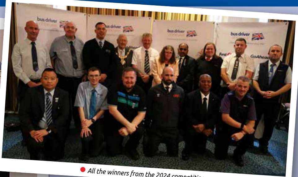
● All the winners from the 2024 competition.