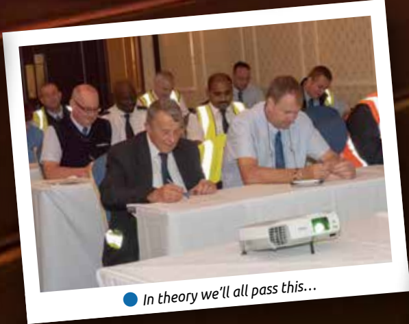
• In theory we'll all pass this...