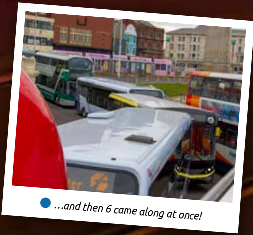
• ...and then 6 came along at once!