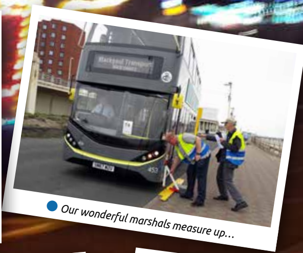
• Our wonderful marshals measure up...