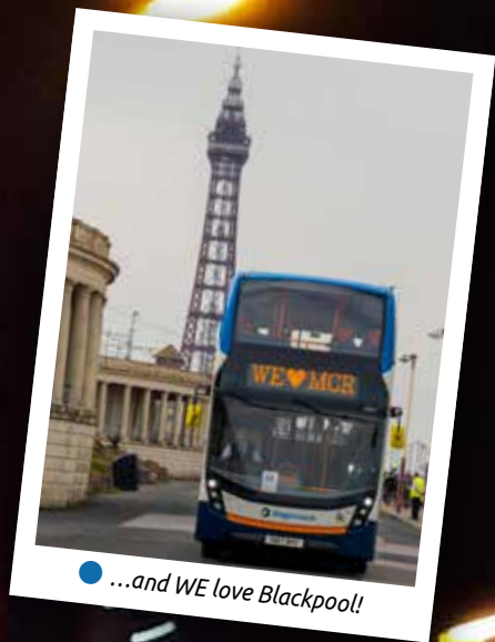
• ...and WE love Blackpool!