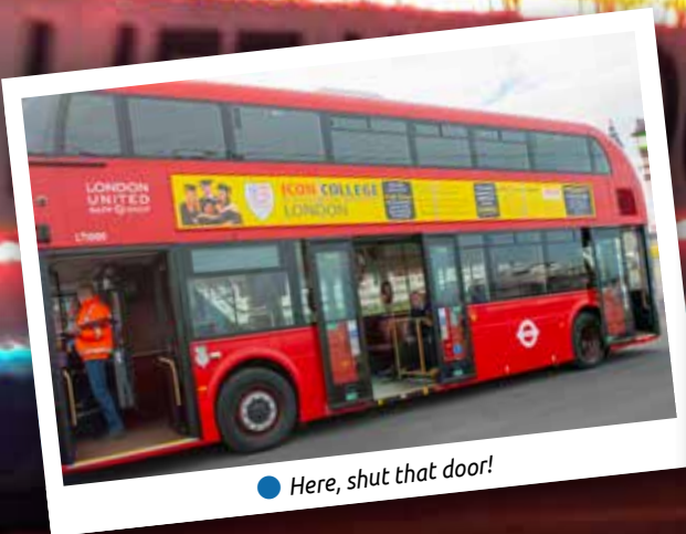
• Here, shut that door!