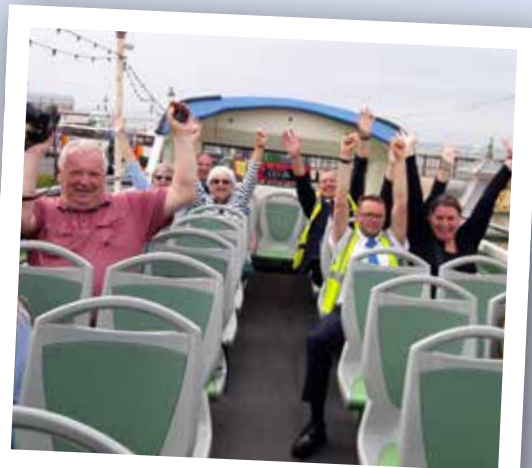
● Happy to be back in Blackpool!

"I would urge any driver who thinks they have it in them to put their skills to the test and to enter in 2019 - it is a great experience and opportunity. I Look forward to seeing you all next year!"