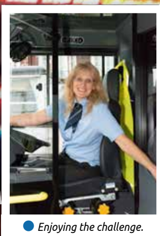
• Enjoying the challenge.