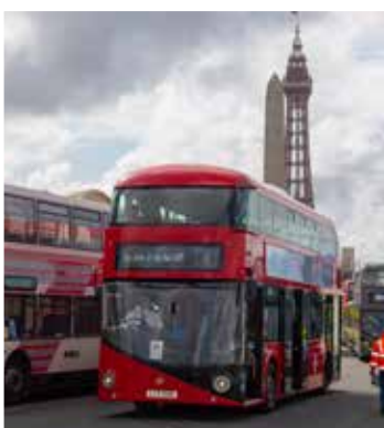
● "It's like Victoria bus station here!"