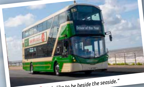
● "I do like to be beside the seaside."