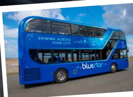
● "A shining example..."