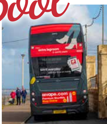
● "A tight fit!"