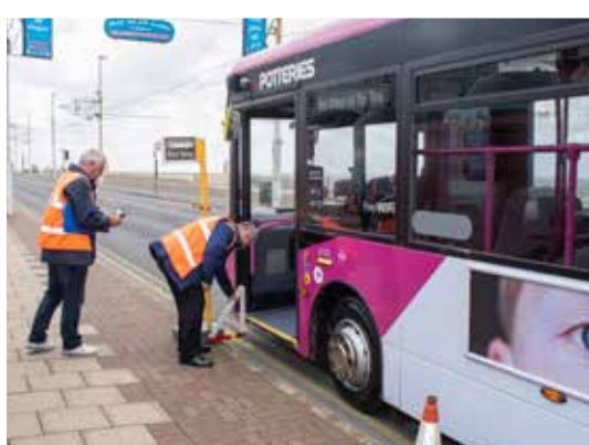
● "Millimetres matter."