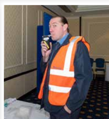
● "Well blow me!!"