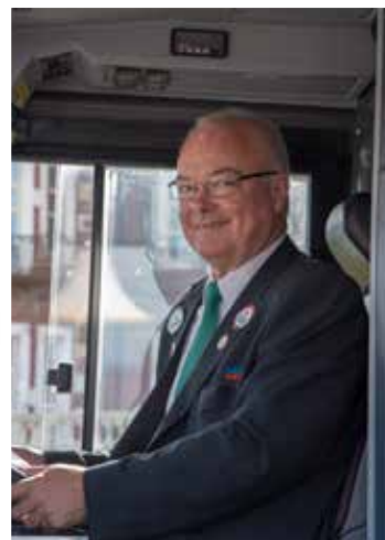
● ...the Professionals...