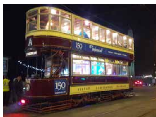
● "Trams? Must be Blackpool!"