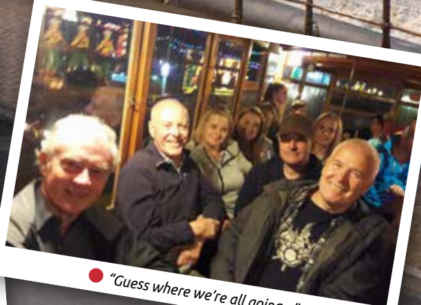
● "Guess where we're all going..."